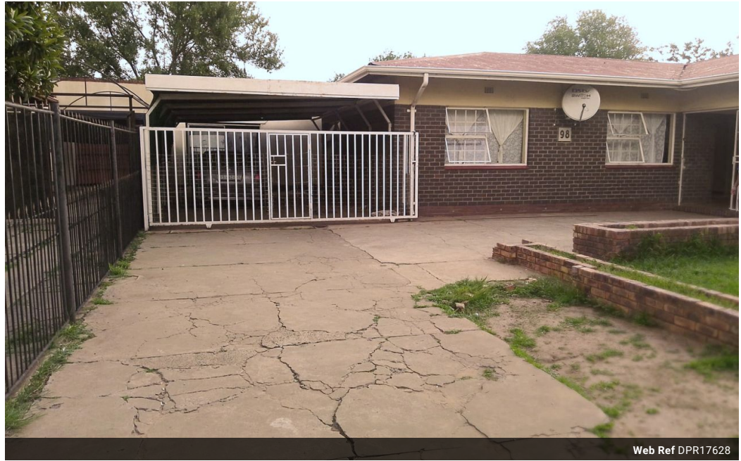
Web Ref DPR17628

Shop 2, The Palms Shopping Center, Louis Trichardt Blvd, Vanderbijlpark, 1911