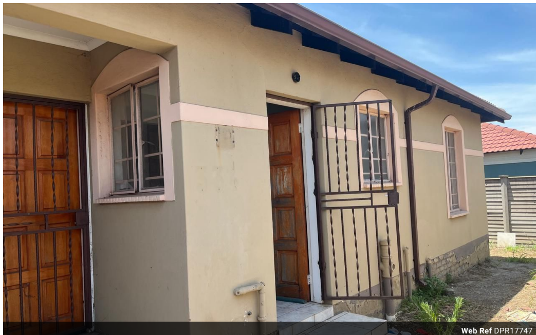
Web Ref DPR17747

Shop 2, The Palms Shopping Center, Louis Trichardt Blvd, Vanderbijlpark, 1911