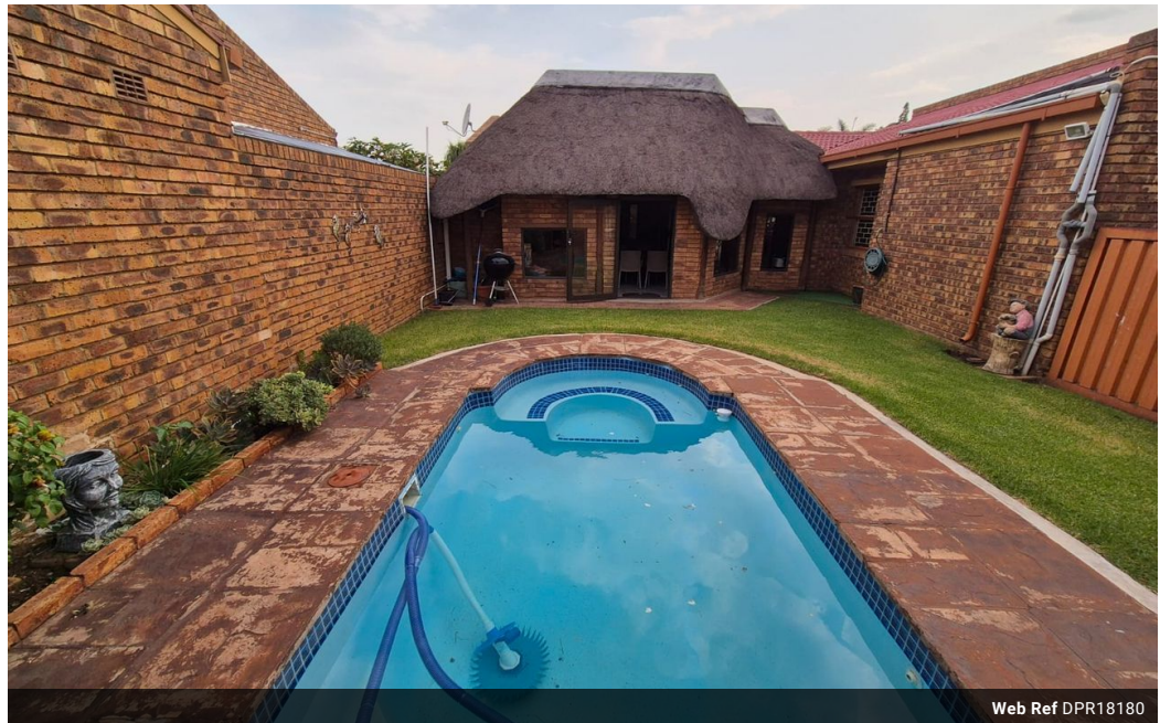
Web Ref DPR1810

Shop 2, The Palms Shopping Center, Louis Trichardt Blvd, Vanderbijlpark, 1911