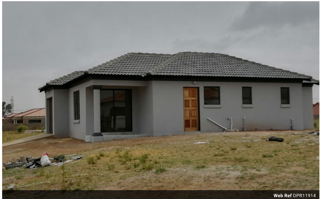
Web Ref DPR11914

Shop 2, The Palms Shopping Center, Louis Trichardt Blvd, Vanderbijlpark, 1911