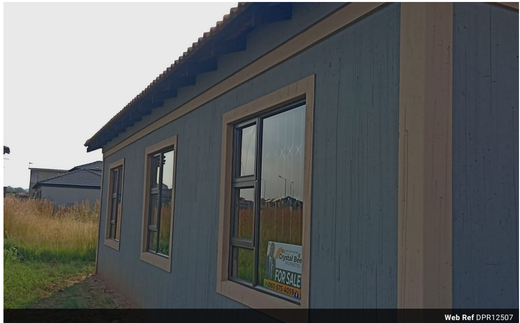
Web Ref DPR12507

Shop 2, The Palms Shopping Center, Louis Trichardt Blvd, Vanderbijlpark, 1911