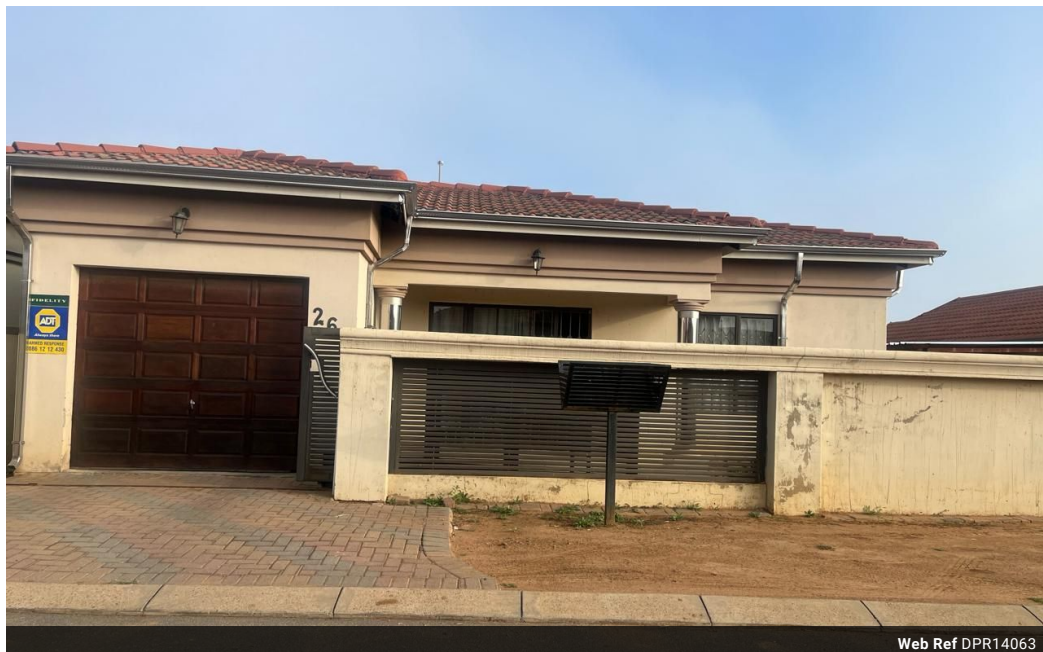
Web Ref DPR14063

Shop 2, The Palms Shopping Center, Louis Trichardt Blvd, Vanderbijlpark, 1911