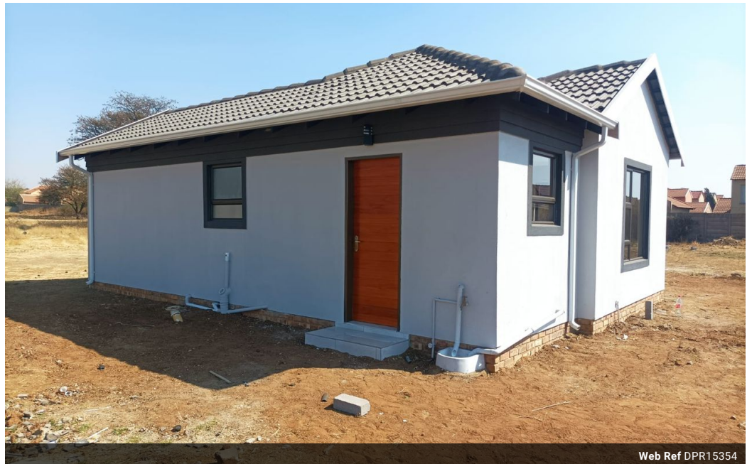
Web Ref DPR15354

Shop 2, The Palms Shopping Center, Louis Trichardt Blvd, Vanderbijlpark, 1911