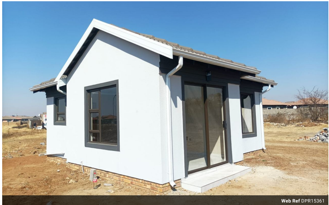
Web Ref DPR15361

Shop 2, The Palms Shopping Center, Louis Trichardt Blvd, Vanderbijlpark, 1911