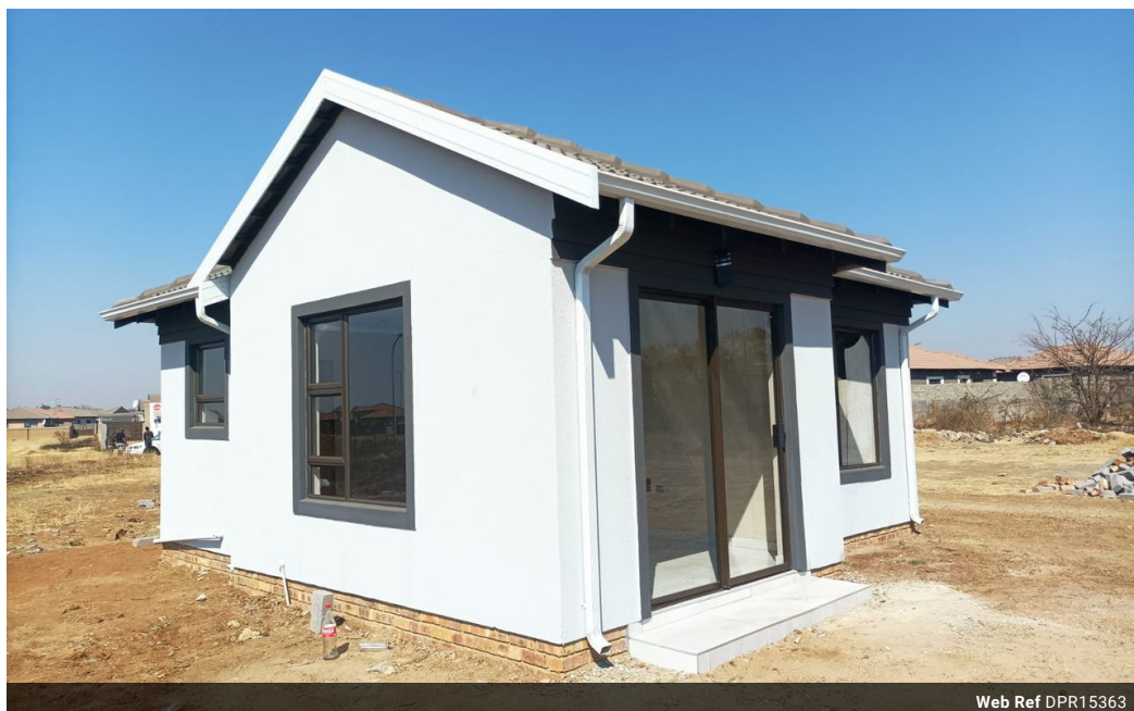
Web Ref DPR15363

Shop 2, The Palms Shopping Center, Louis Trichardt Blvd, Vanderbijlpark, 1911