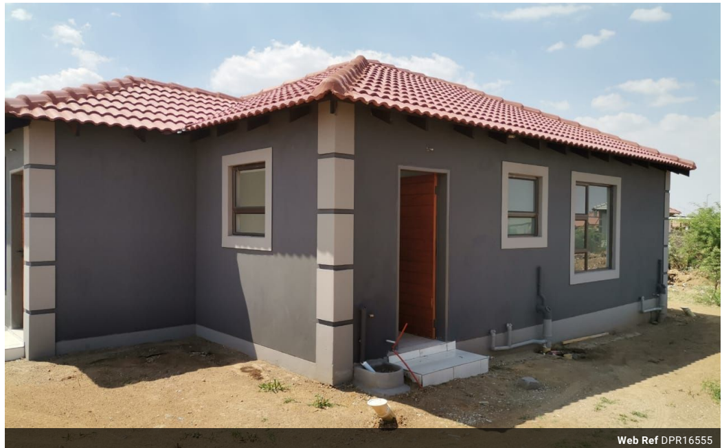
Web Ref DPR16555

Shop 2, The Palms Shopping Center, Louis Trichardt Blvd, Vanderbijlpark, 1911