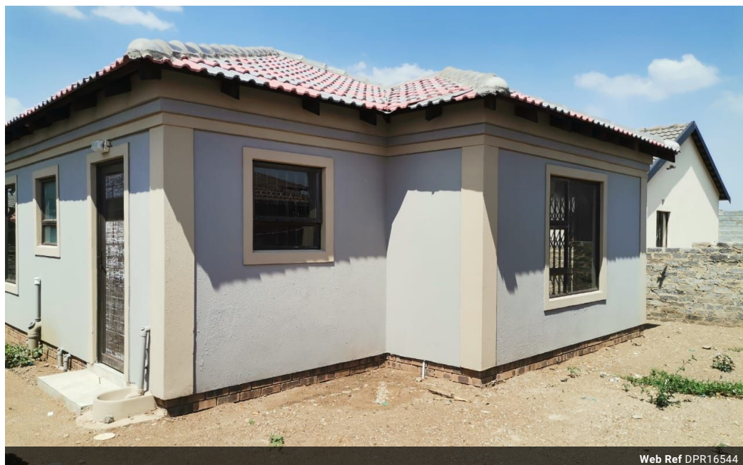
Web Ref DPR16544

Shop 2, The Palms Shopping Center, Louis Trichardt Blvd, Vanderbijlpark, 1911