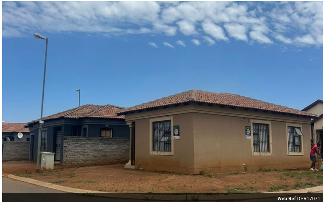
Web Ref DPR17071

Shop 2, The Palms Shopping Center, Louis Trichardt Blvd, Vanderbijlpark, 1911