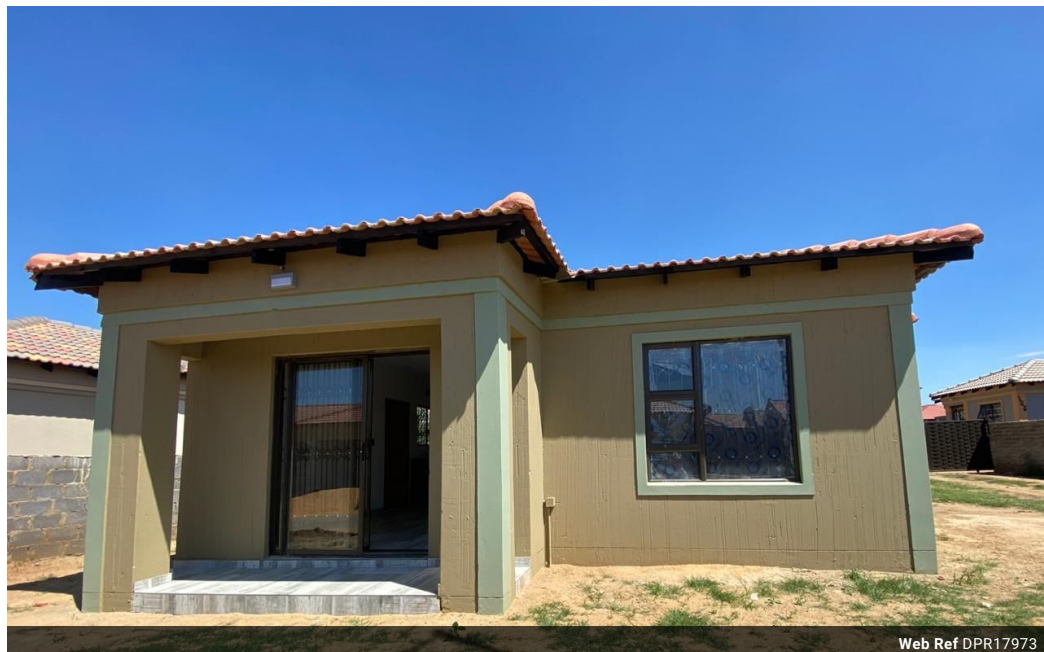
Web Ref DPR17973

Shop 2, The Palms Shopping Center, Louis Trichardt Blvd, Vanderbijlpark, 1911