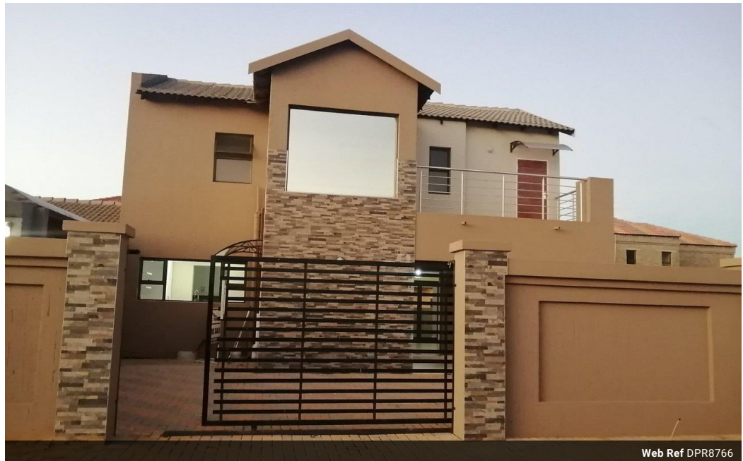
Web Ref DPR8766

Shop 2, The Palms Shopping Center, Louis Trichardt Blvd, Vanderbijlpark, 1911