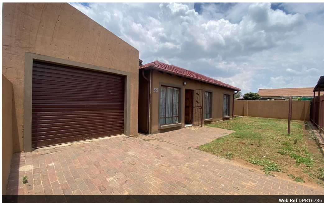
Web Ref DPR16786

Shop 2, The Palms Shopping Center, Louis Trichardt Blvd, Vanderbijlpark, 1911