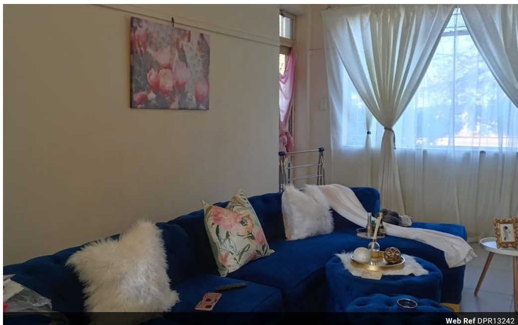
Web Ref DPR13242

Shop 2, The Palms Shopping Center, Louis Trichardt Blvd, Vanderbijlpark, 1911