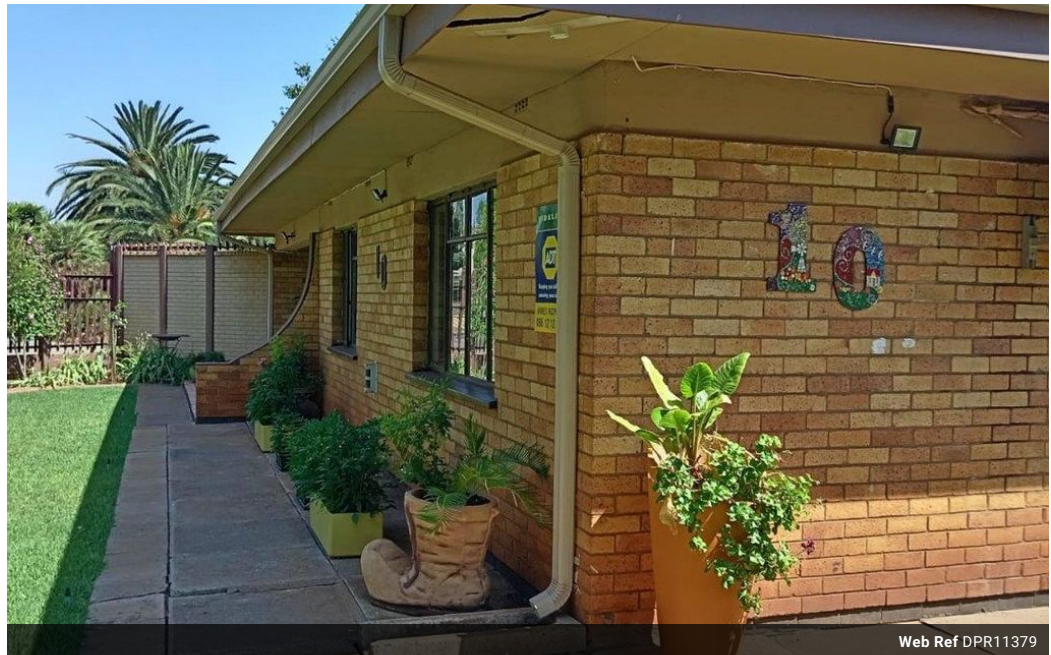
Web Ref DPR11379

Shop 2, The Palms Shopping Center, Louis Trichardt Blvd, Vanderbijlpark, 1911