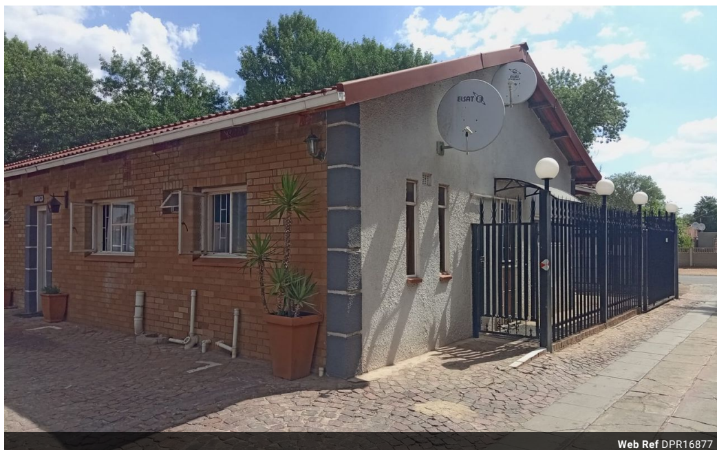
Web Ref DPR16877

Shop 2, The Palms Shopping Center, Louis Trichardt Blvd, Vanderbijlpark, 1911