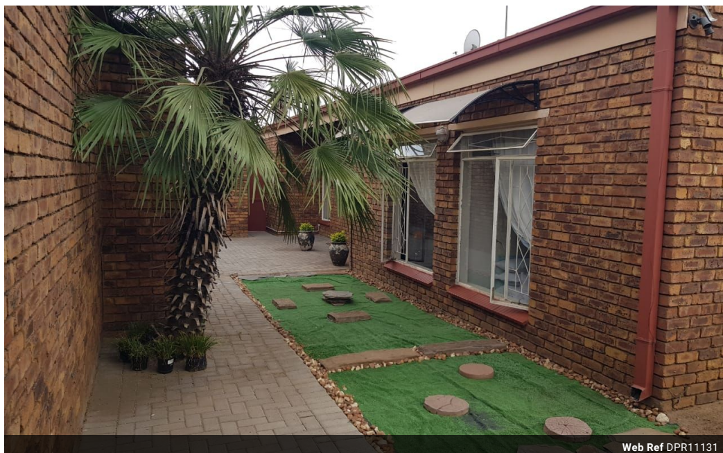
Web Ref DPR11131

Shop 2, The Palms Shopping Center, Louis Trichardt Blvd, Vanderbijlpark, 1911