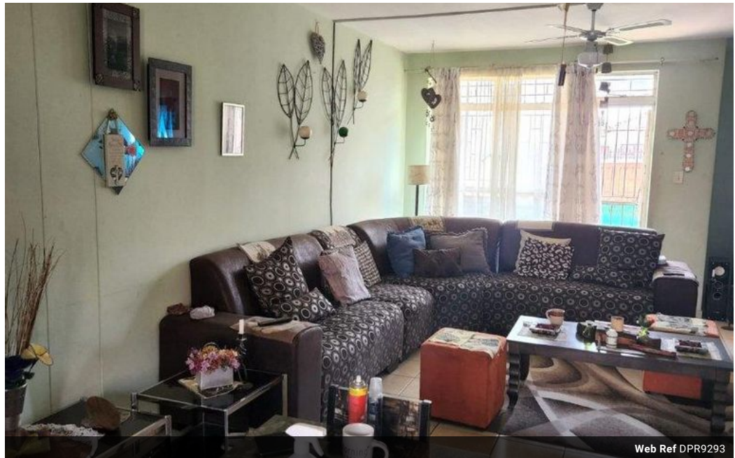
Web Ref DPR9293

Shop 2, The Palms Shopping Center, Louis Trichardt Blvd, Vanderbijlpark, 1911