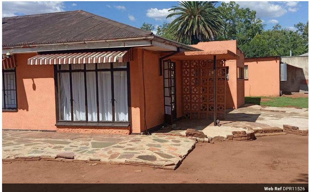
Web Ref DPR11526

Shop 2, The Palms Shopping Center, Louis Trichardt Blvd, Vanderbijlpark, 1911