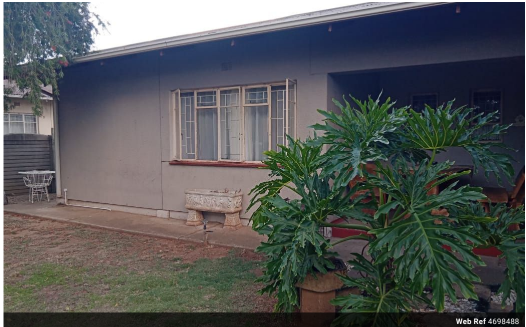
Web Ref 4698488

18 Klip River Drive, Three Rivers, Vereeniging