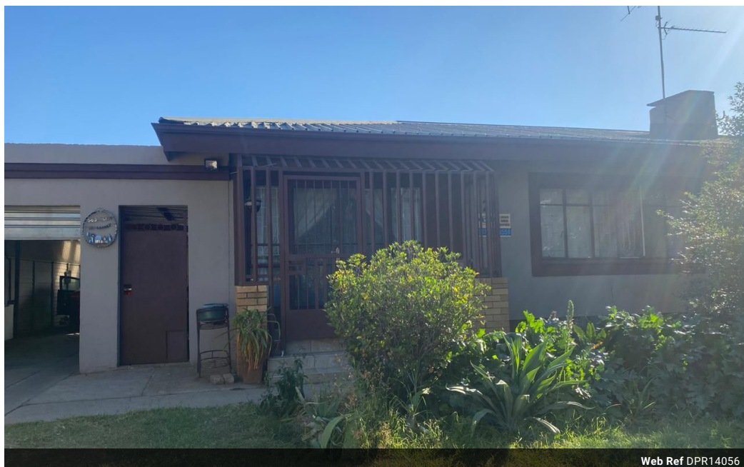
Web Ref DPR14056

Shop 2, The Palms Shopping Center, Louis Trichardt Blvd, Vanderbijlpark, 1911