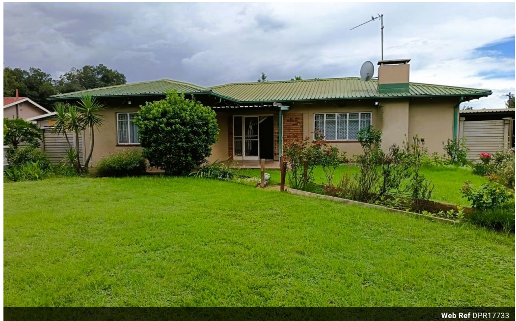
Web Ref DPR17733

18 Klipriver Drive Three Rivers Vereeniging