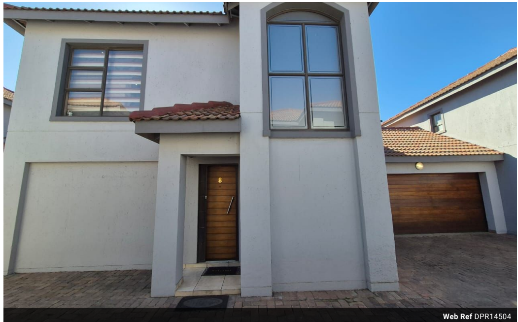
Web Ref DPR14504

Shop 2, The Palms Shopping Center, Louis Trichardt Blvd, Vanderbijlpark, 1911