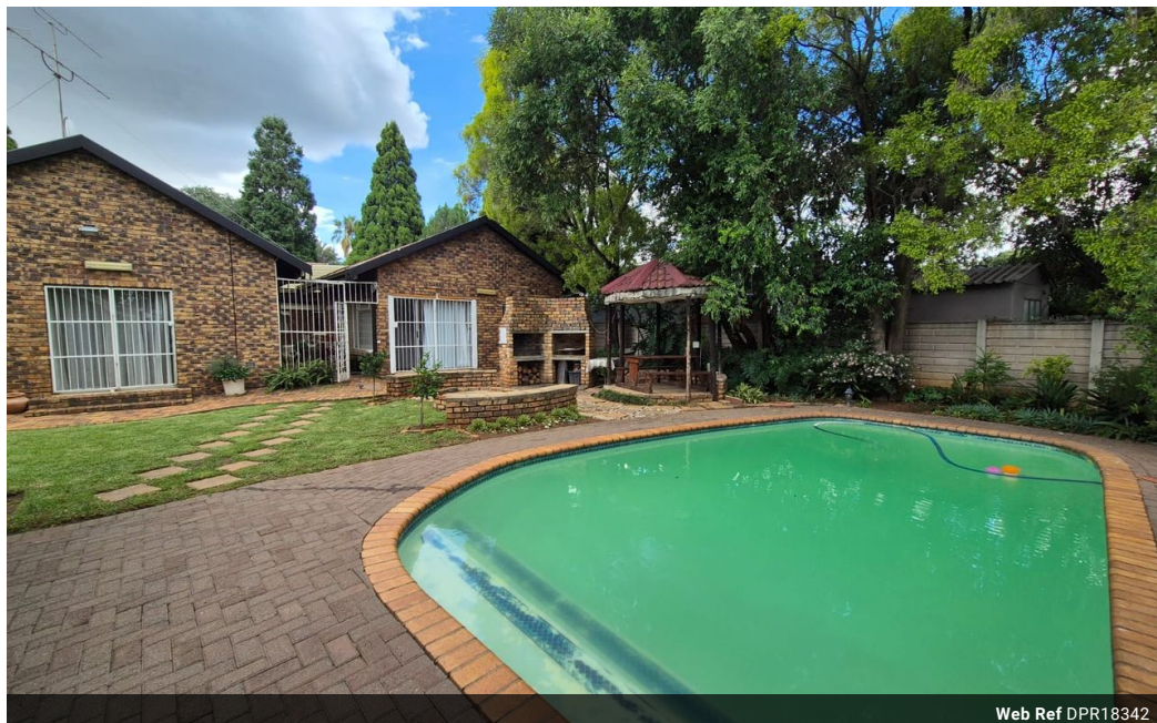
Web Ref DPR18342

Shop 2, The Palms Shopping Center, Louis Trichardt Blvd, Vanderbijlpark, 1911