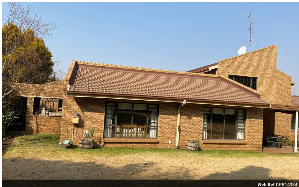
Web Ref DPR14934

Shop 2, The Palms Shopping Center, Louis Trichardt Blvd, Vanderbijlpark, 1911