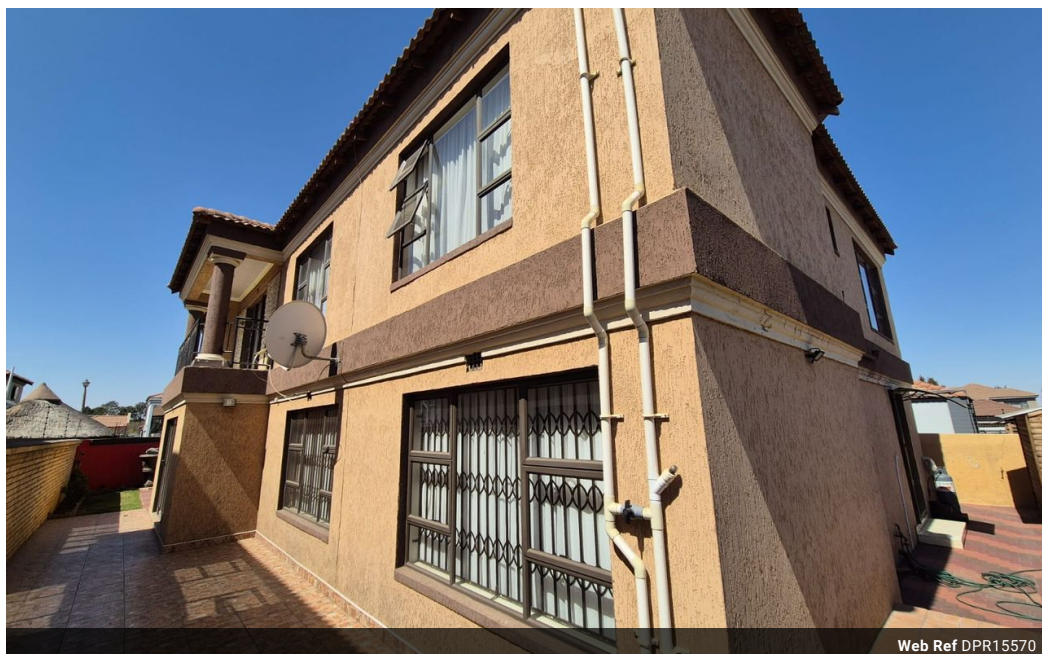
Web Ref DPR15570

Shop 2, The Palms Shopping Center, Louis Trichardt Blvd, Vanderbijlpark, 1911