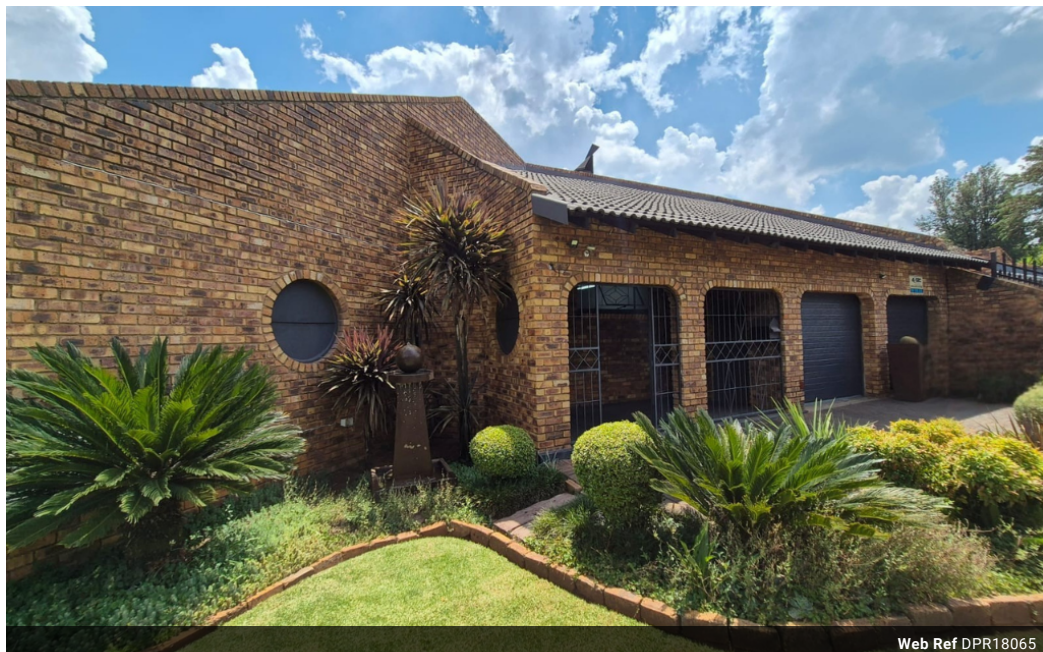
Web Ref DPR18065

Shop 2, The Palms Shopping Center, Louis Trichardt Blvd, Vanderbijlpark, 1911