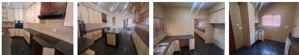
Web Ref DPG2766822