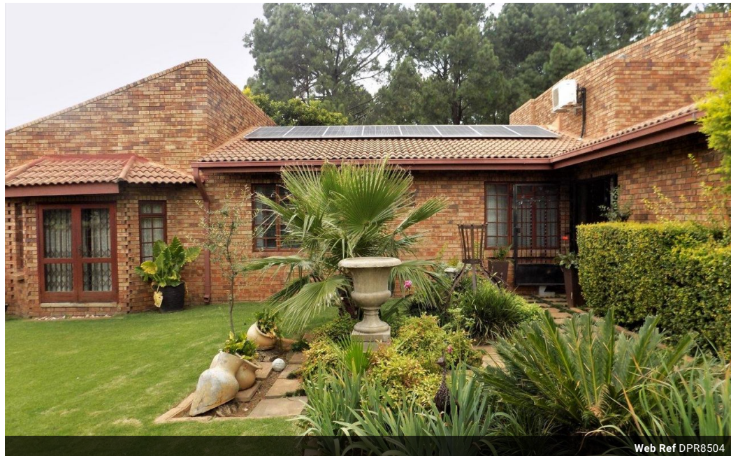
Web Ref DPR8504

Shop 2, The Palms Shopping Center, Louis Trichardt Blvd, Vanderbijlpark, 1911