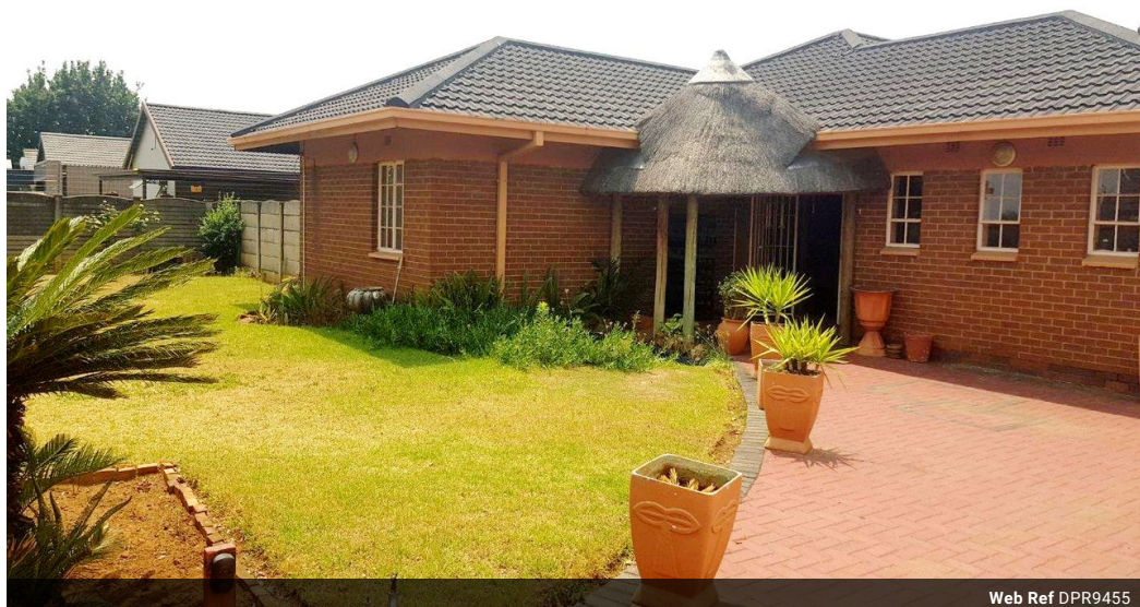
Web Ref DPR9455

Shop 2, The Palms Shopping Center, Louis Trichardt Blvd, Vanderbijlpark, 1911