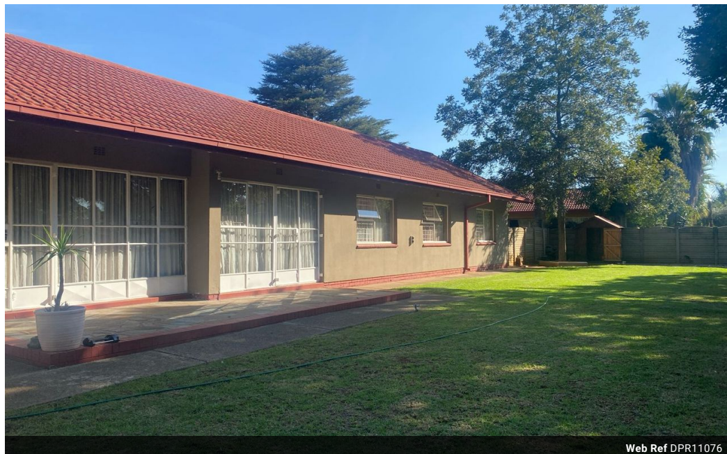
Web Ref DPR11076

Shop 2, The Palms Shopping Center, Louis Trichardt Blvd, Vanderbijlpark, 1911