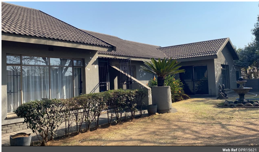
Web Ref DPR15621

Shop 2, The Palms Shopping Center, Louis Trichardt Blvd, Vanderbijlpark, 1911