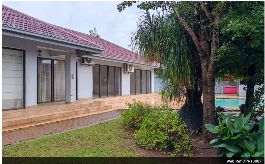
Web Ref DPR18887

Shop 2, The Palms Shopping Center, Louis Trichardt Blvd, Vanderbijlpark, 1911