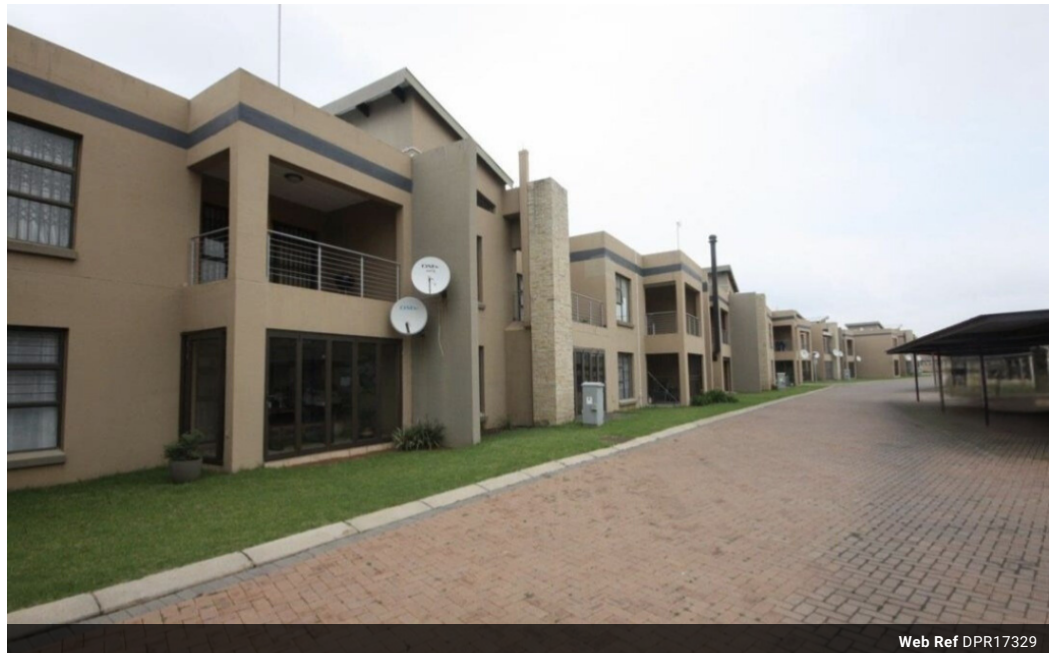
Web Ref DPR17329

Shop 2, The Palms Shopping Center, Louis Trichardt Blvd, Vanderbijlpark, 1911