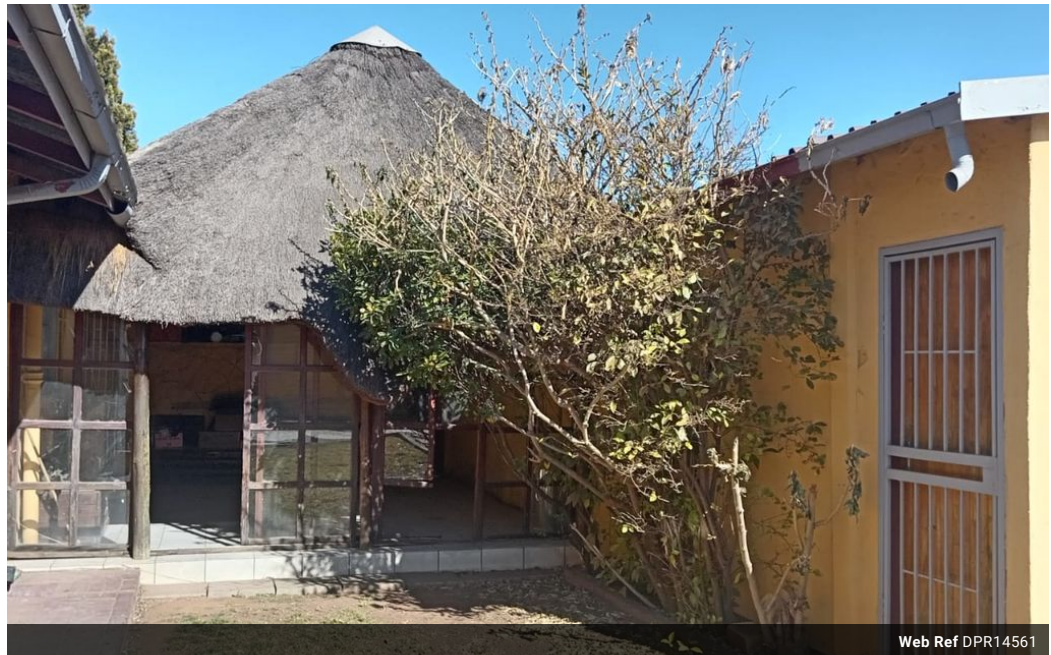
Web Ref DPR14561

Shop 2, The Palms Shopping Center, Louis Trichardt Blvd, Vanderbijlpark, 1911