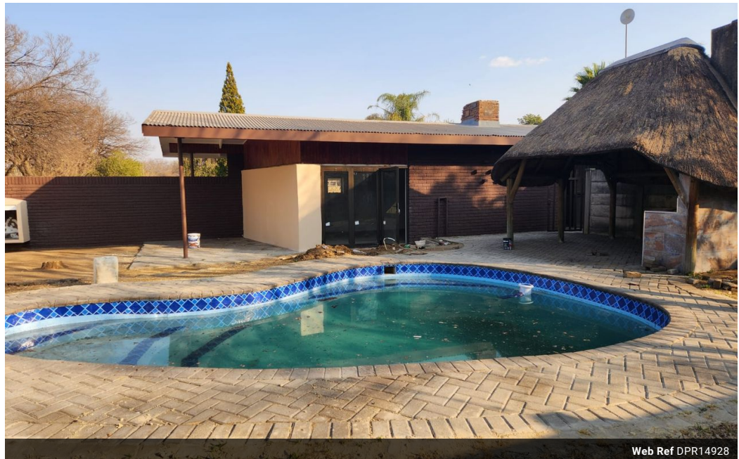
Web Ref DPR14928

Shop 2, The Palms Shopping Center, Louis Trichardt Blvd, Vanderbijlpark, 1911