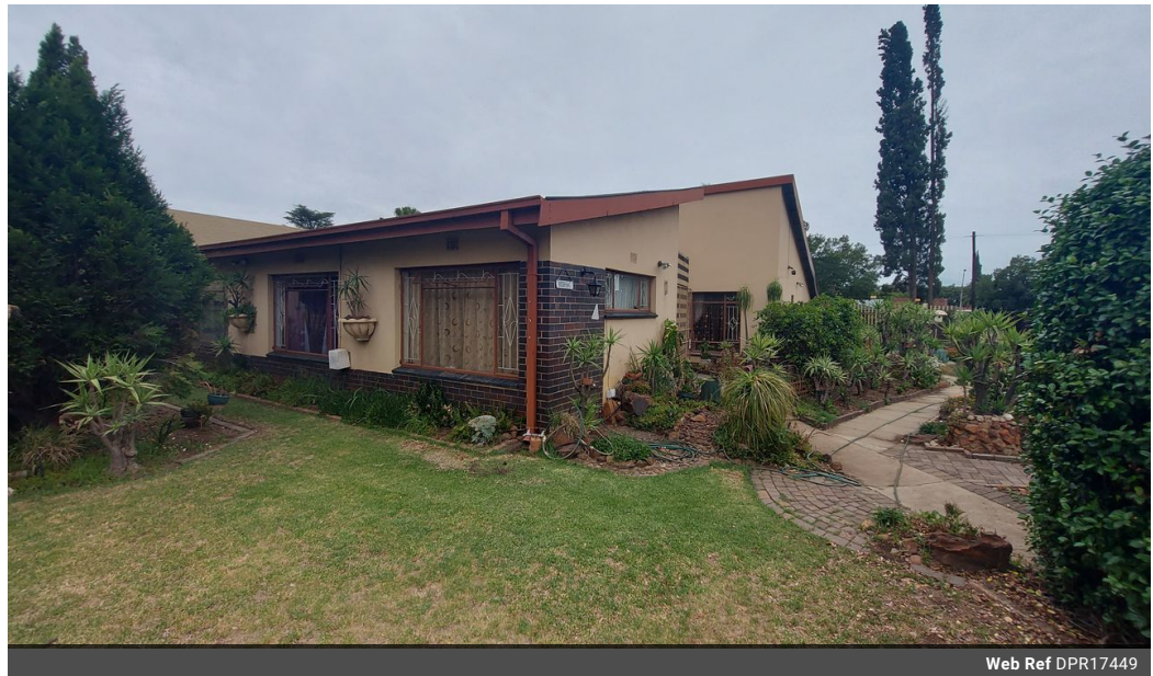
Web Ref DPR17449

Shop 2, The Palms Shopping Center, Louis Trichardt Blvd, Vanderbijlpark, 1911