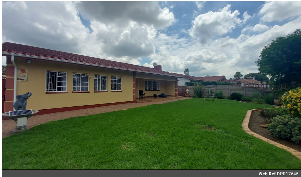
Web Ref DPR17645

Shop 2, The Palms Shopping Center, Louis Trichardt Blvd, Vanderbijlpark, 1911