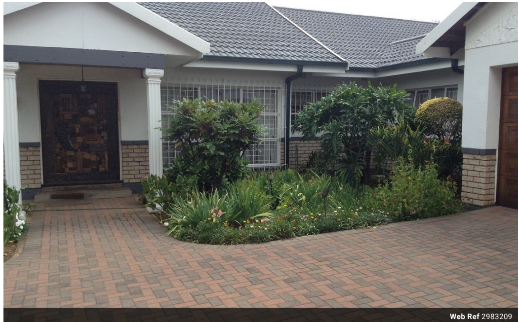
Web Ref 2983209

18 Klip River Drive, Three Rivers, Vereeniging