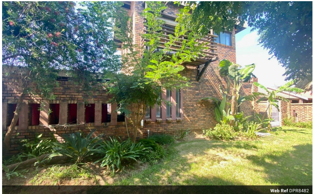
Web Ref DPR8482

Shop 2, The Palms Shopping Center, Louis Trichardt Blvd, Vanderbijlpark, 1911