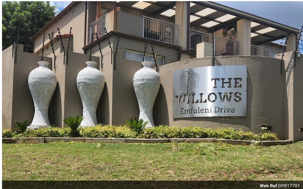
Web Ref DPR17701

Shop 2, The Palms Shopping Center, Louis Trichardt Blvd, Vanderbijlpark, 1911