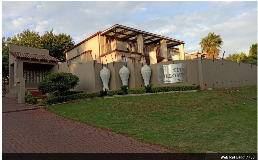
Web Ref DPR17750

Shop 2, The Palms Shopping Center, Louis Trichardt Blvd, Vanderbijlpark, 1911