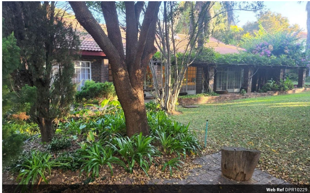
Web Ref DPR10229

Shop 2, The Palms Shopping Center, Louis Trichardt Blvd, Vanderbijlpark, 1911