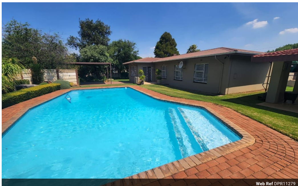
Web Ref DPR11279

Shop 2, The Palms Shopping Center, Louis Trichardt Blvd, Vanderbijlpark, 1911