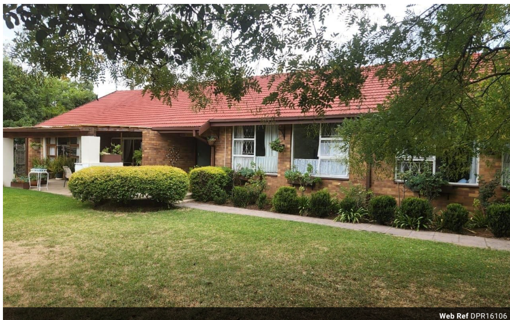
Web Ref DPR16106

Shop 2, The Palms Shopping Center, Louis Trichardt Blvd, Vanderbijlpark, 1911