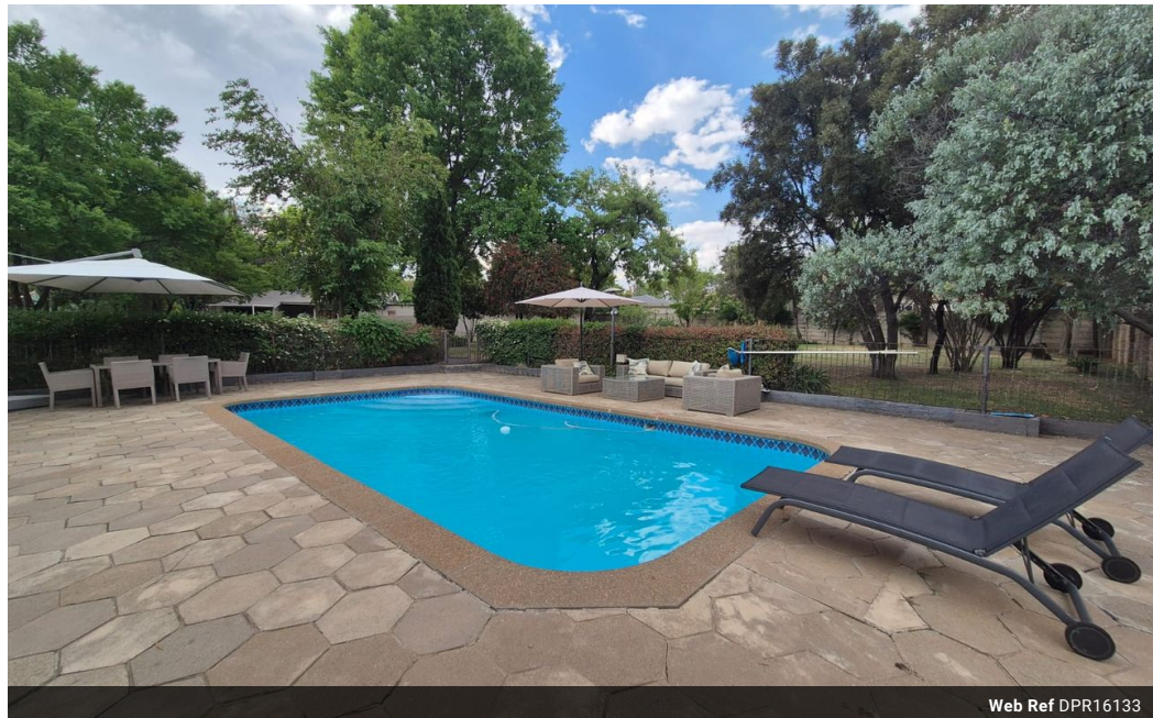
Web Ref DPR16133

Shop 2, The Palms Shopping Center, Louis Trichardt Blvd, Vanderbijlpark, 1911