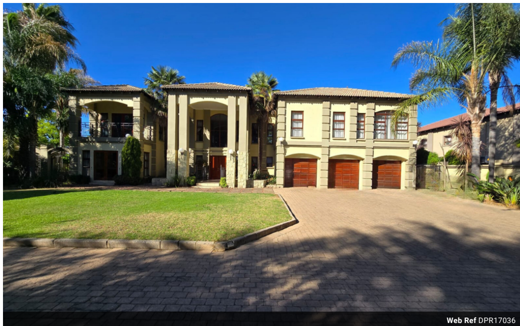
Web Ref DPR17036

Shop 2, The Palms Shopping Center, Louis Trichardt Blvd, Vanderbijlpark, 1911