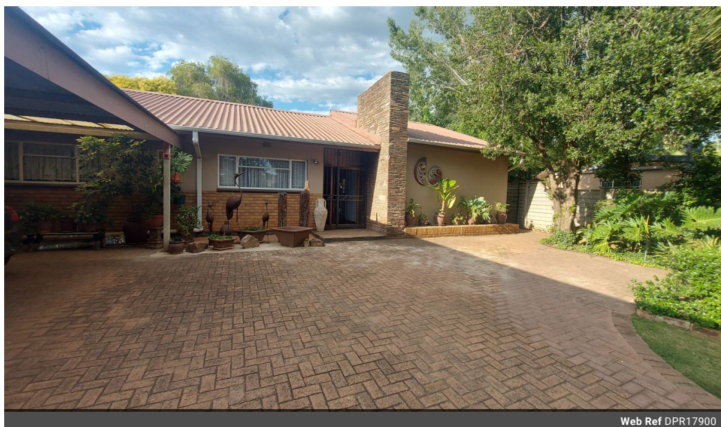
Web Ref DPR17900

Shop 2, The Palms Shopping Center, Louis Trichardt Blvd, Vanderbijlpark, 1911